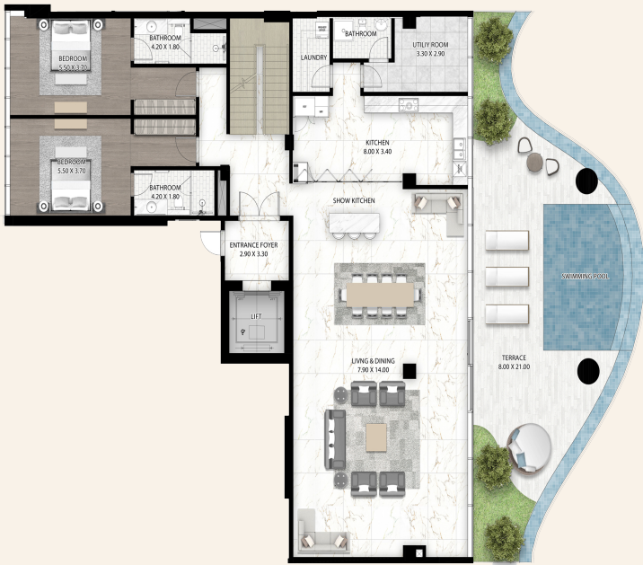
LEVEL 13 (LOWER)