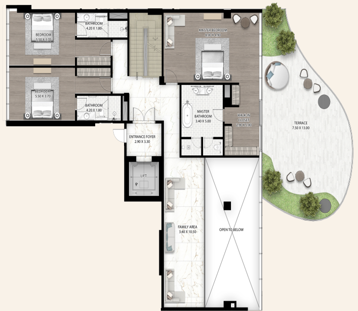
LEVEL 14 (UPPER)